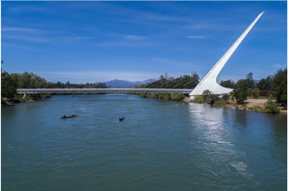
California River Quest Starting Point

We decided that we wanted it back. Well, not exactly. We wanted to get more of our friends and a lot of other paddlers on that stretch of the Sacramento River. For years we'd heard that people wanted to play on the riv-