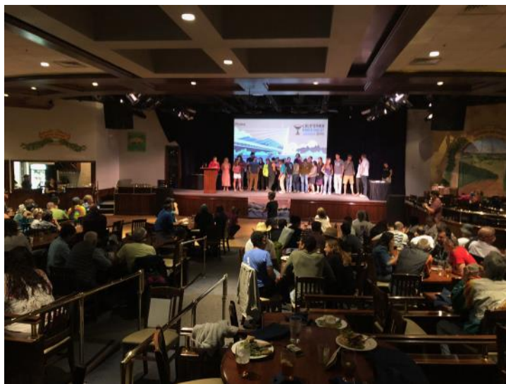
Post-race lunch at Sierra Nevada Brewery