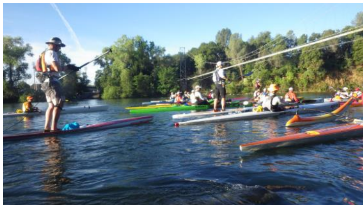
Starting lineup at River Quest