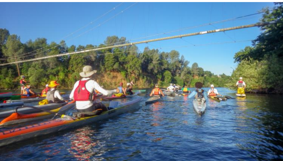
River Quest Race Start

Two weeks later, we announced the event and opened registration for the 2019 California River Quest to be held Memorial Day weekend. What the hell , we thought. It's worth a try . To our delight, we quickly had excited